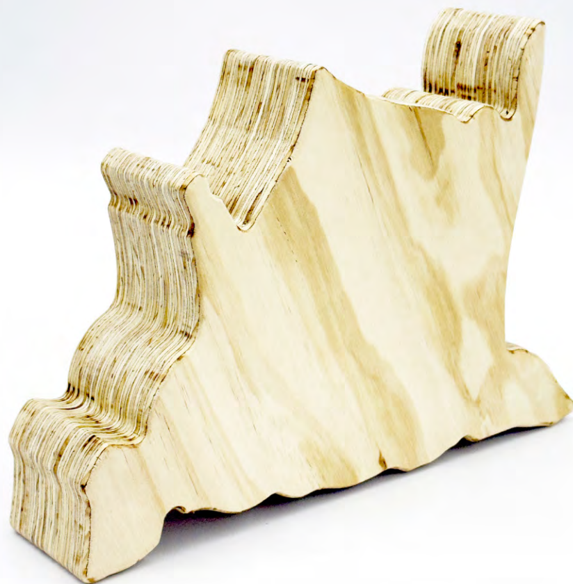
Fausto Amundarain BP #2, 2026 Plywood 29 x 41 x 9 cm