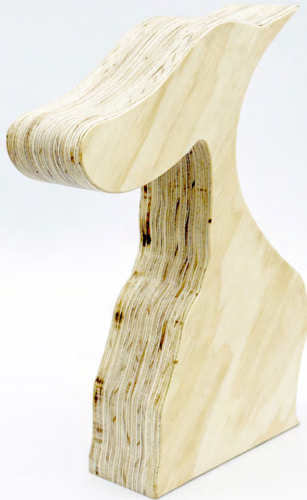
Fausto Amundarain BP #1, 2026 Plywood 46 x 37 x 9 cm