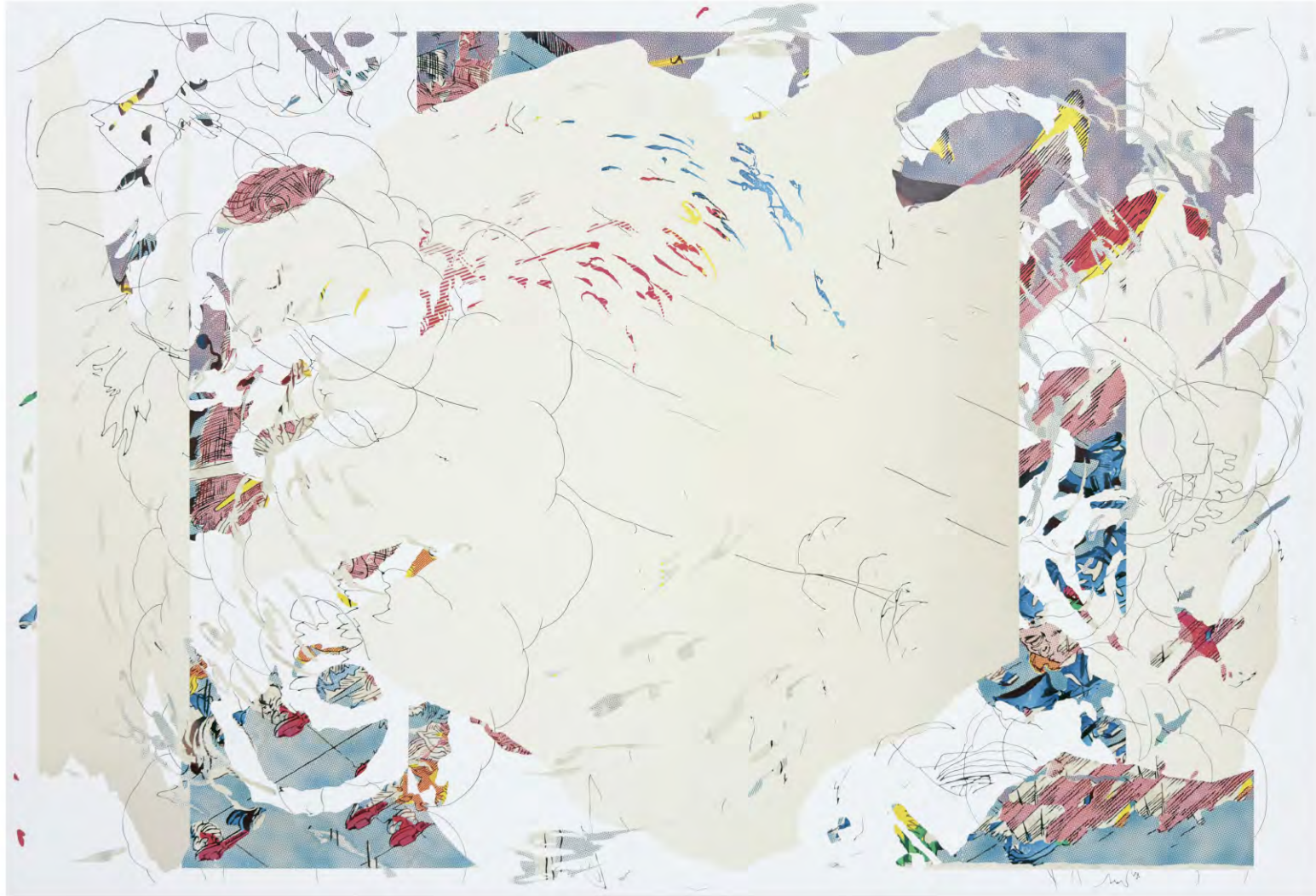
Fausto Amundarain Points of departure, 2026 Acrylic on canvas 150 x 220 cm