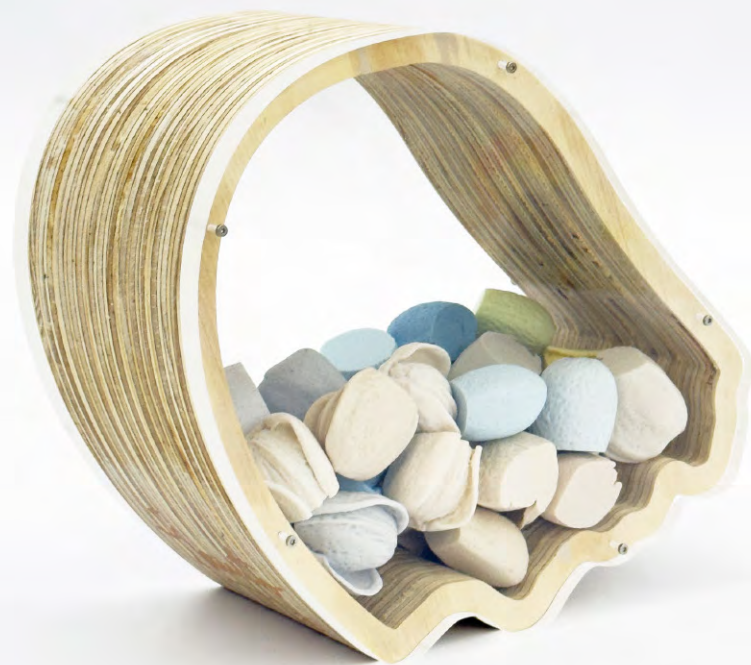
Fausto Amundarain Birdfeeder as a prop #3, 2026 Plywood, pigmented polyester resin, methacrylate 23 x 20 x 11 cm