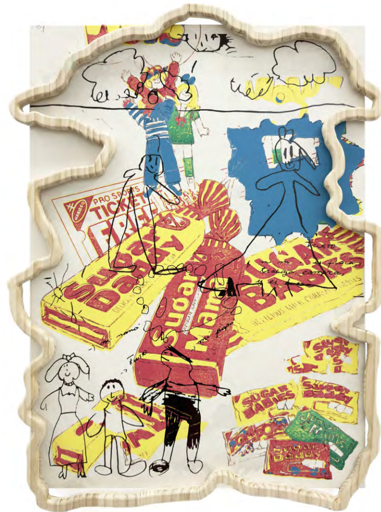
Fausto Amundarain Sugar babies, 2026 Acrylic on canvas custom wood frame 96 x 72 cm