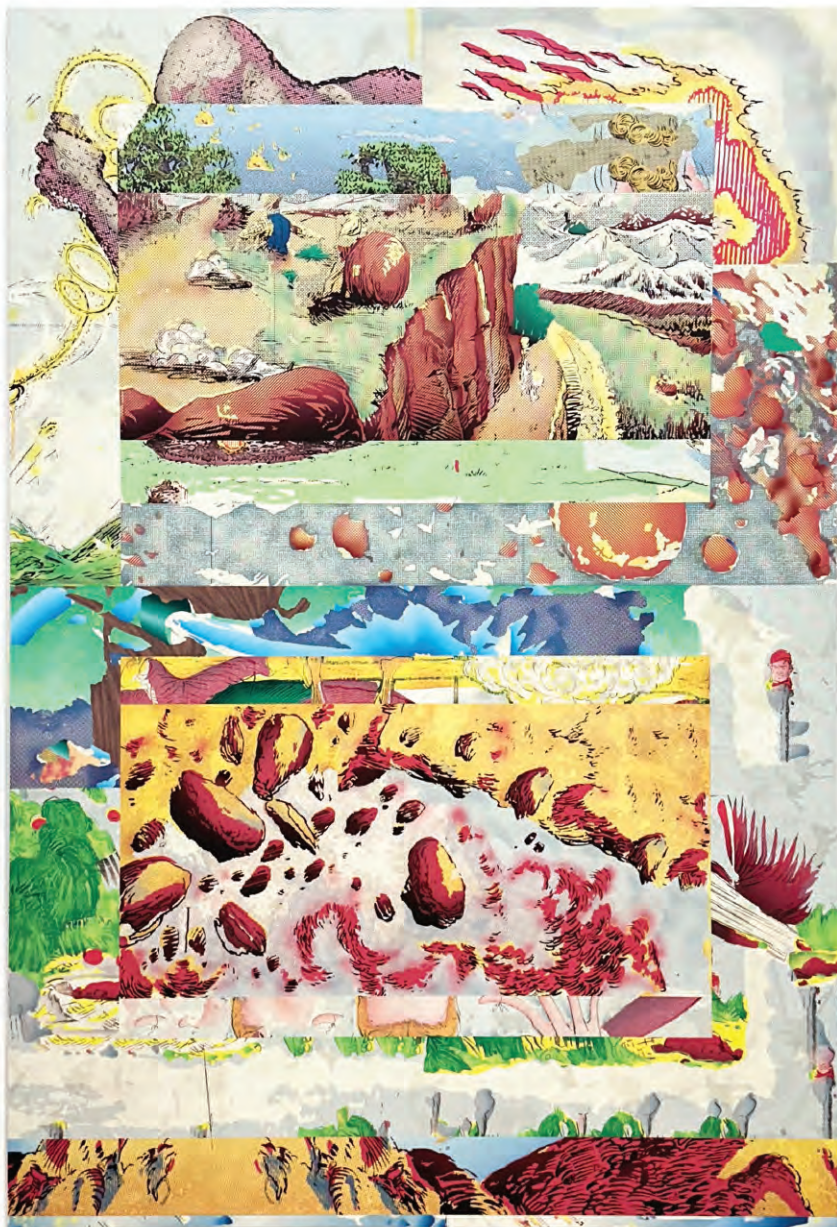
Fausto Amundarain Compulsive repetition as refuge, 2026 Acrylic on canvas 220 x 150 cm