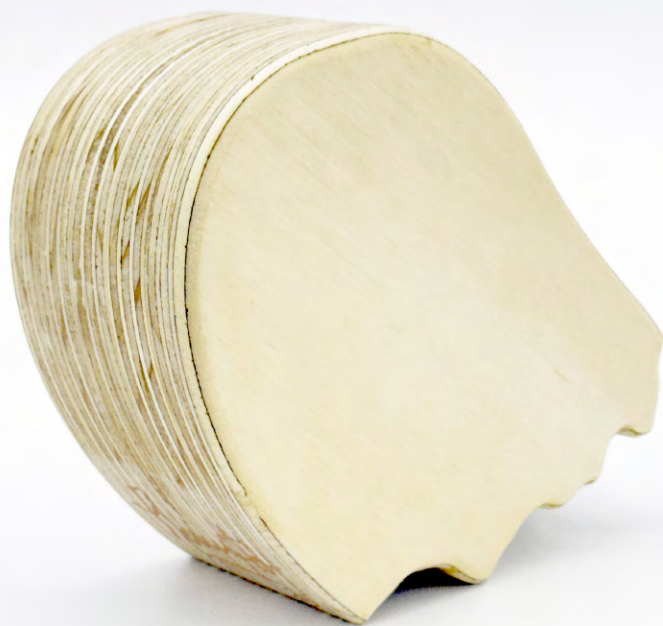
Fausto Amundarain BP #3, 2026 Plywood 18 x 21 x 9 cm