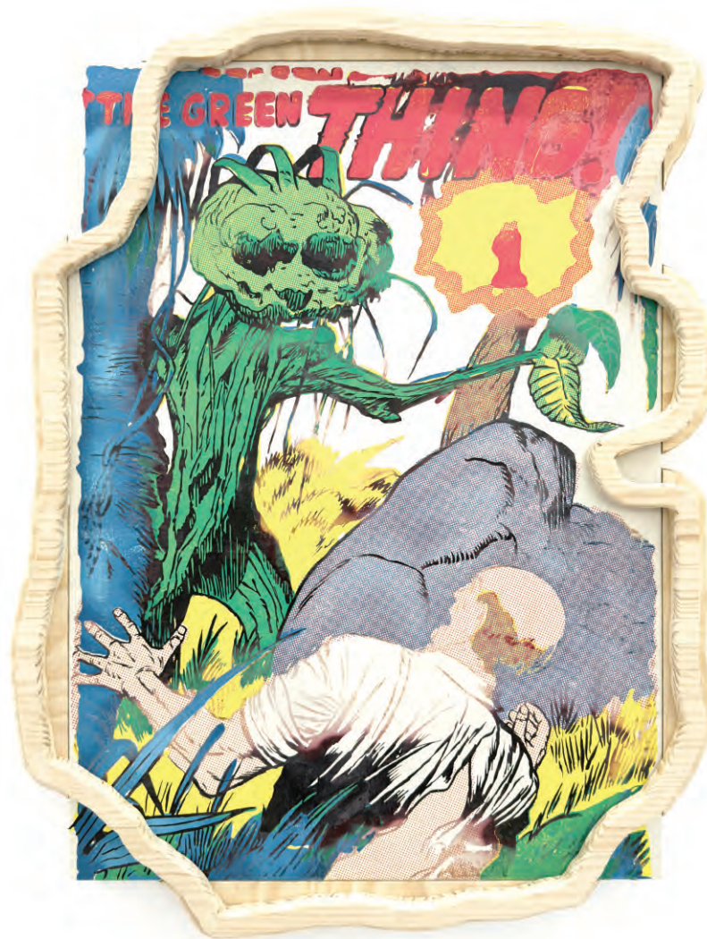
Fausto Amundarain Green Thing, 2026 Acrylic on canvas custom wood frame 111 x 85 cm