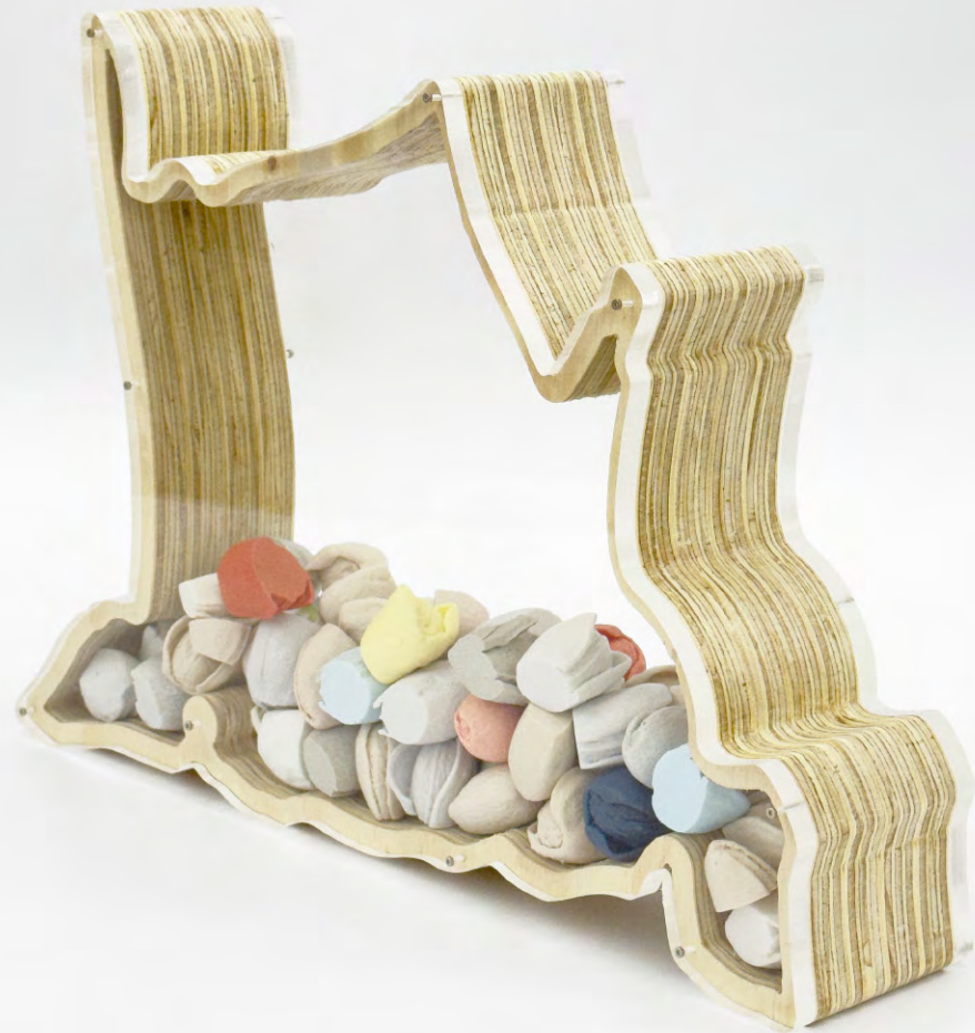
Fausto Amundarain Birdfeeder as a prop #2, 2026 Plywood, pigmented polyester resin, methacrylate 31 x 43 x 9.5 cm