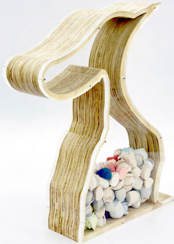
Fausto Amundarain Birdfeeder as a prop #1, 2026 Plywood, pigmented polyester resin, methacrylate 47 x 40 x 11 cm