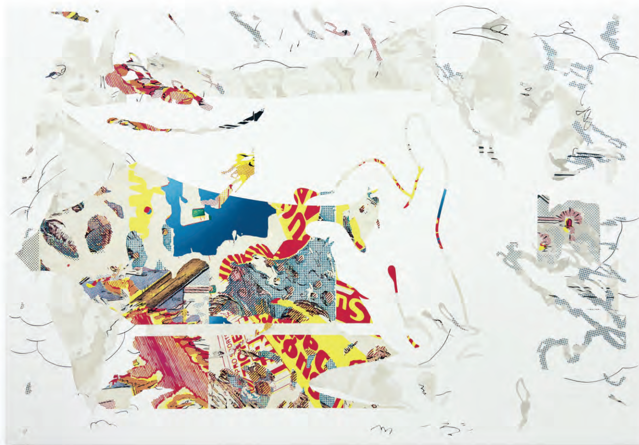
Fausto Amundarain Cortina, 2026 Acrylic on canvas 90 x 130 cm