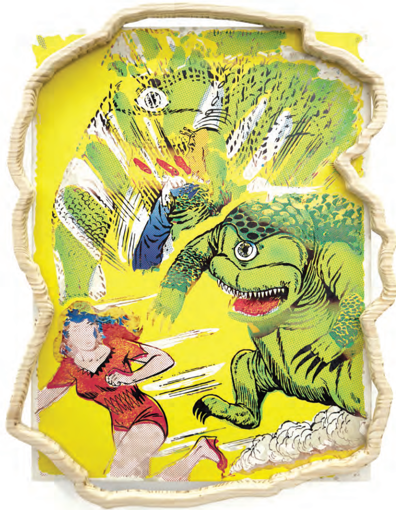
Fausto Amundarain Prop master, 2026 Acrylic on canvas custom wood frame 87 x 67 cm