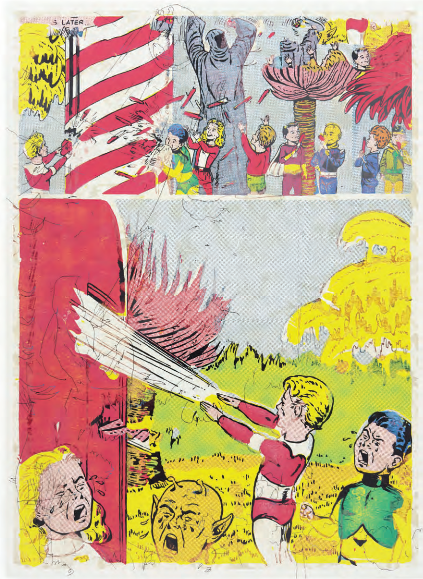
Fausto Amundarain Things we hide, 2026 Acrylic on canvas 180 x 130 cm