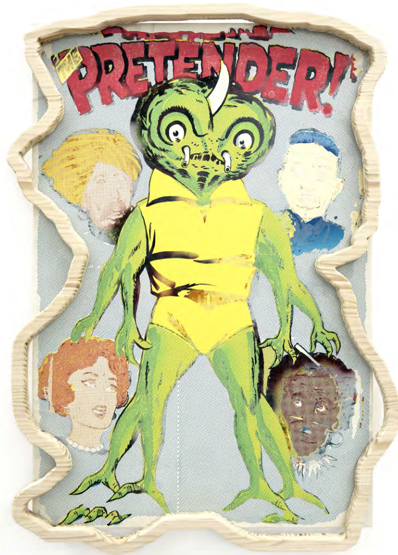
Fausto Amundarain The Pretender, 2026 Acrylic on canvas custom wood frame 112 x 79 cm