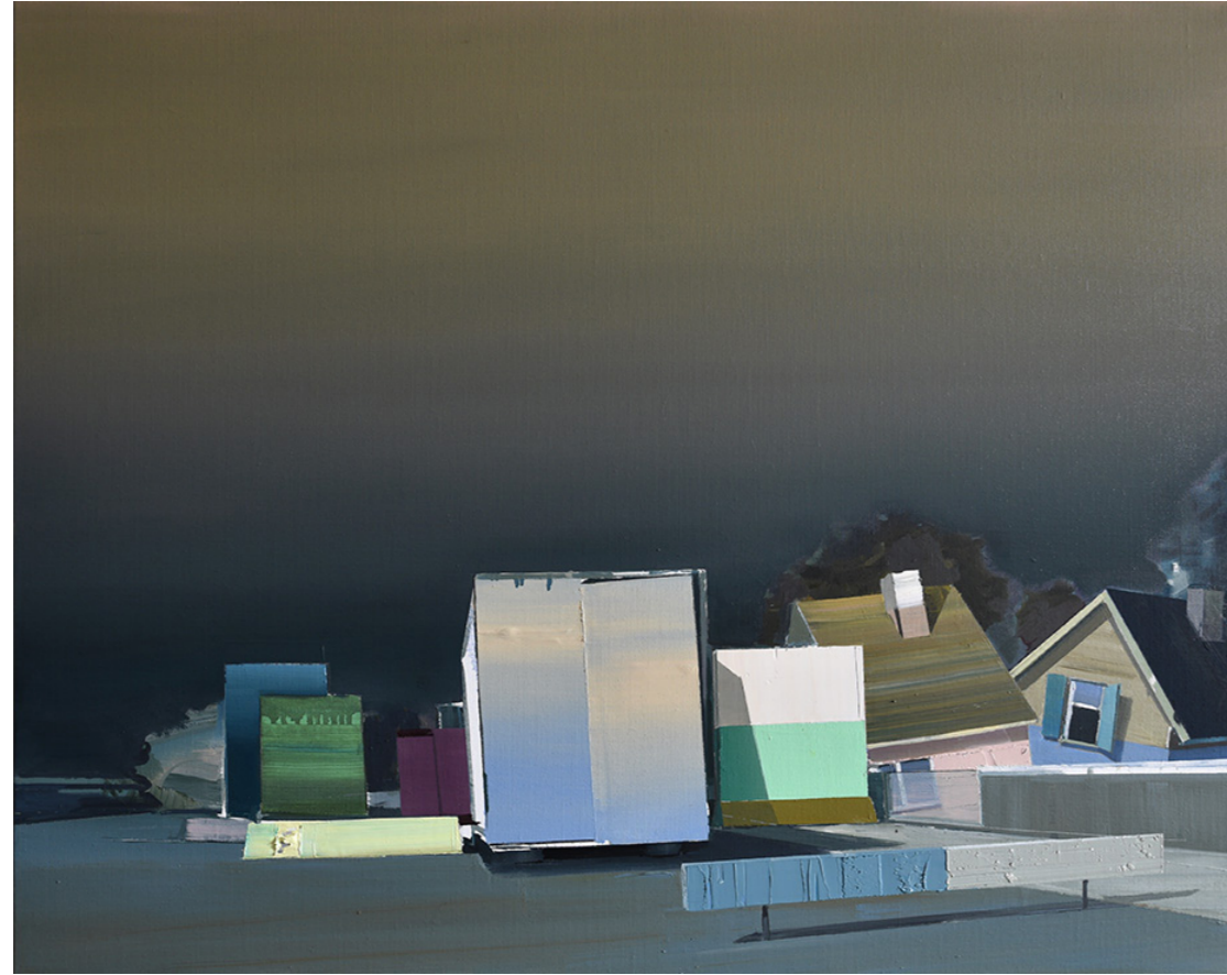
Ulf Puder Sommerliche Dorfstraße 2020 Oil on canvas 80 x 100 cm