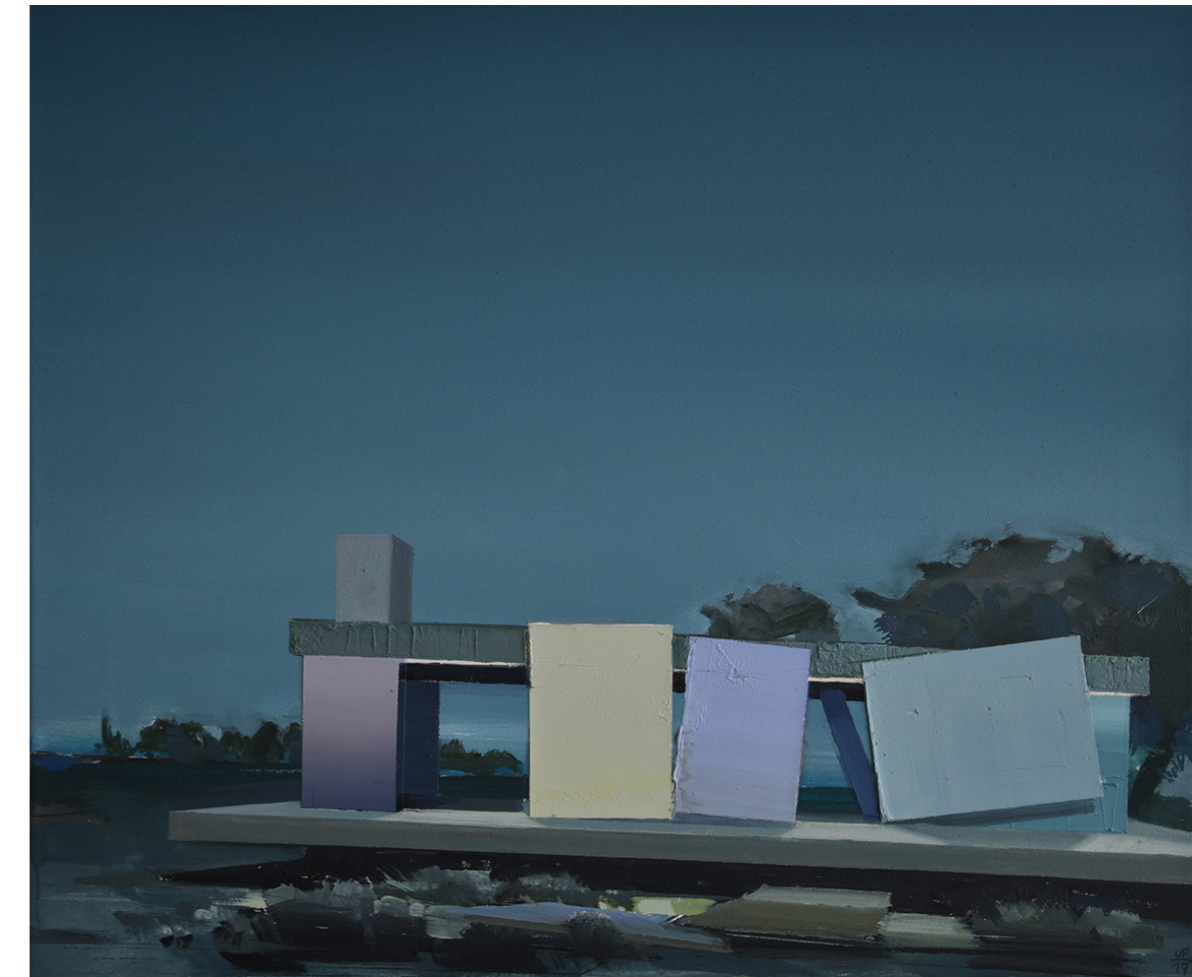
Ulf Puder Das blaue Haus, 2020 Oil on canvas 50 x 60 cm