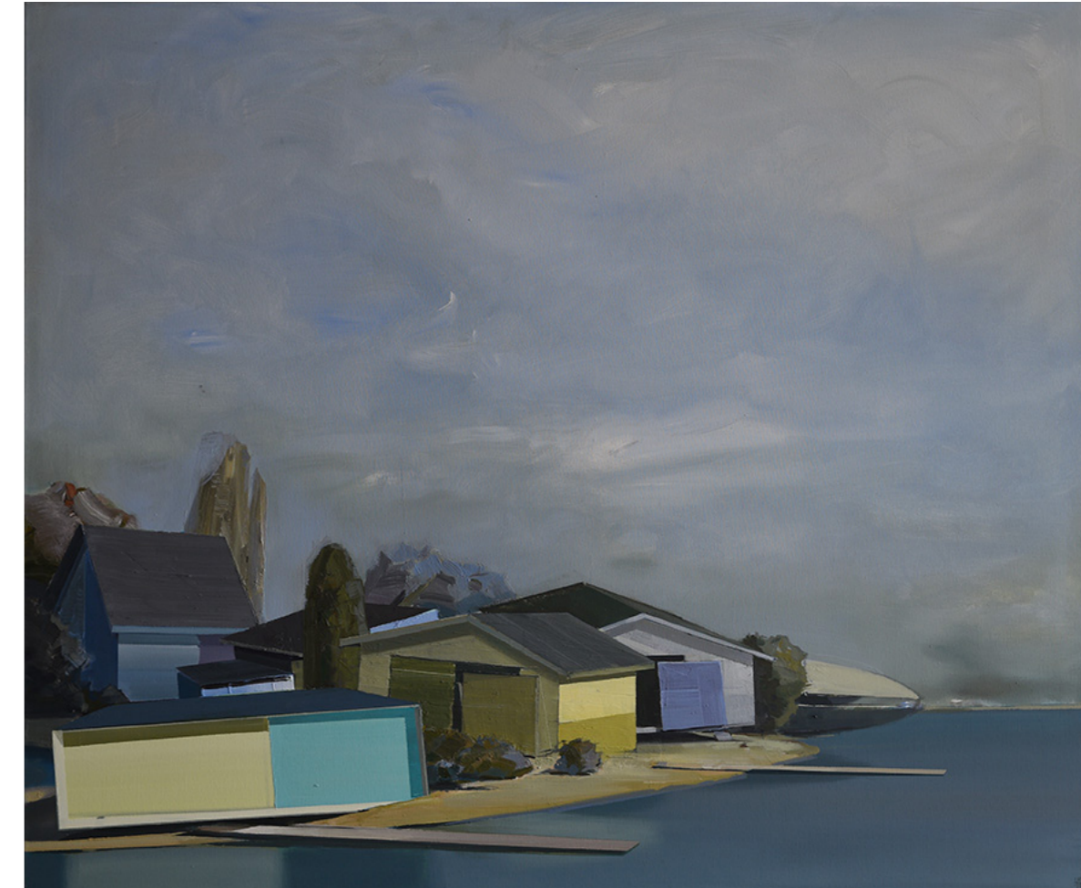
Ulf Puder Stimmung an der Fulge, 2020 Oil on canvas 100 x 120 cm