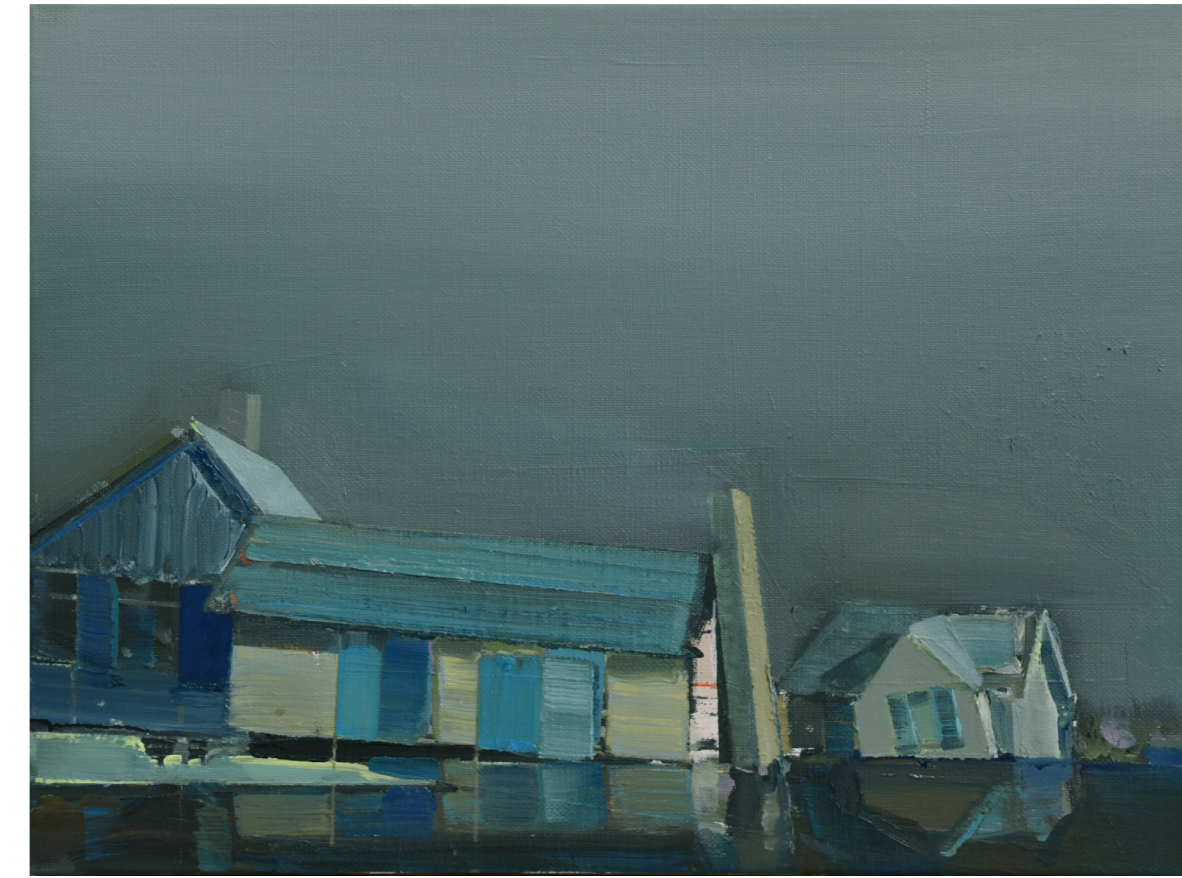
Ulf Puder Ebene bei Auvers, 2020 Oil on canvas 30 x 40 cm