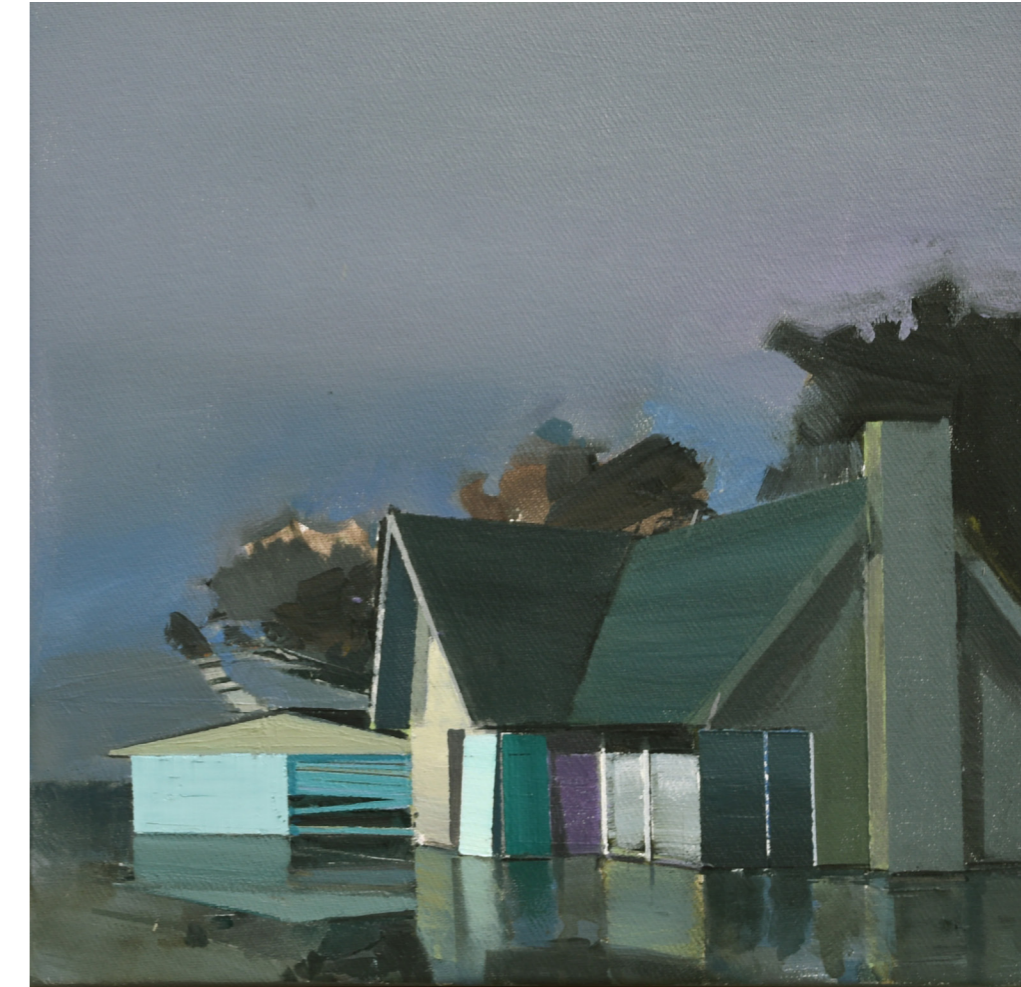
Ulf Puder Riva am Gardasee 2, 2020 Oil on canvas 30 x 30 cm