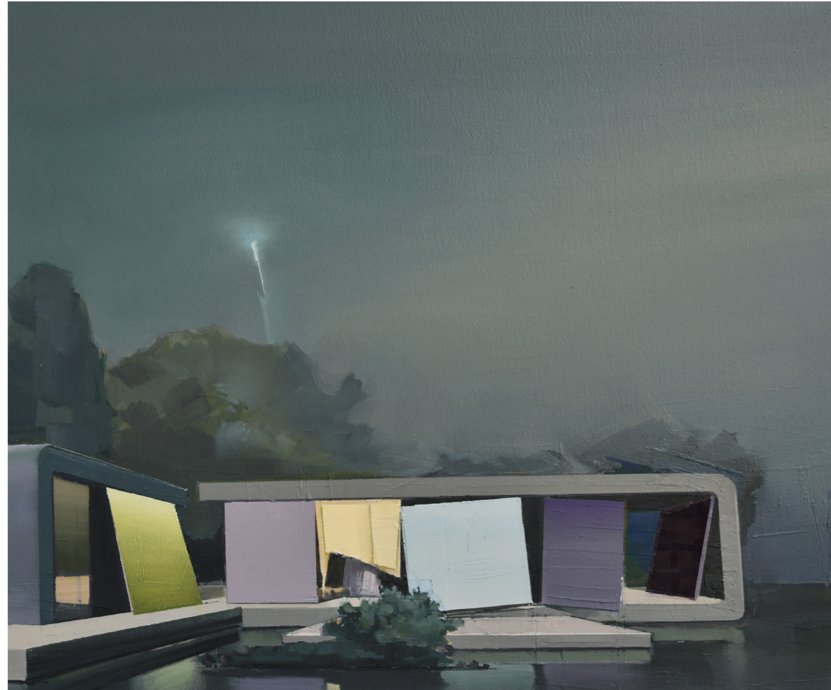
Ulf Puder Das Gewitter, 2020 Oil on canvas 50 x 60 cm