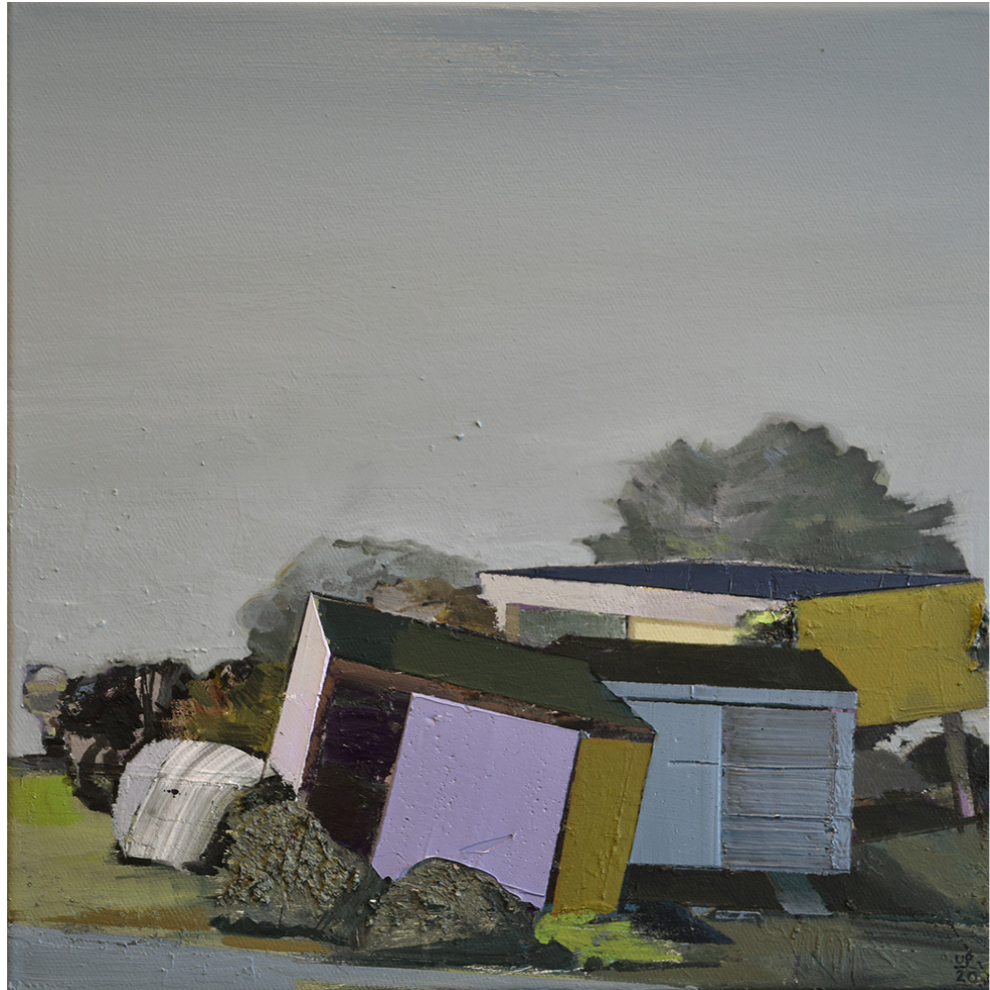
Ulf Puder River shed with lobster traps, 2020 Oil on canvas 40 x 40 cm