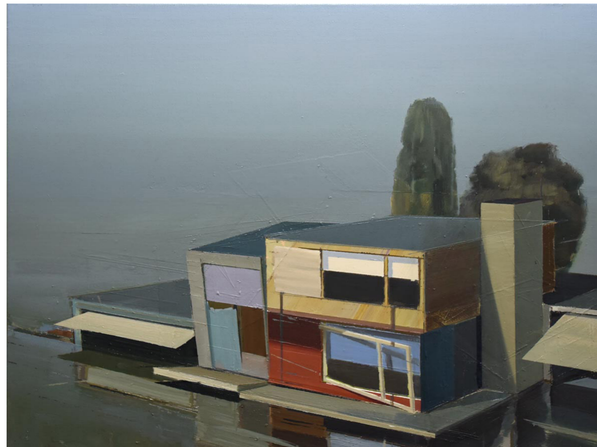
Ulf Puder Bauerngehöft, im Hintergrund der Saarstein bei Aussee, 2020 Oil on canvas 80 x 100 cm