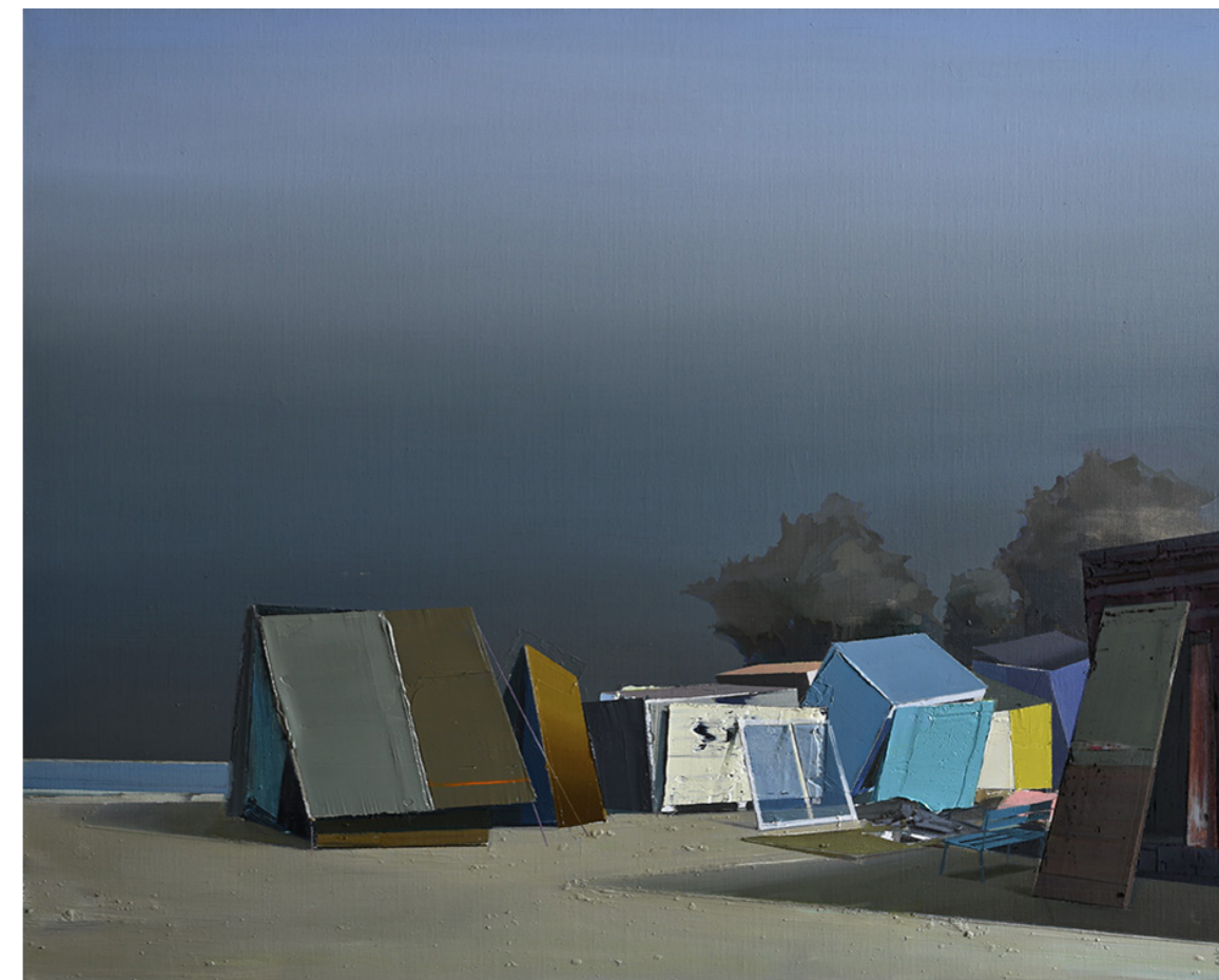
Ulf Puder Stadtlandschaft, 2020 Oil on canvas 80 x 100 cm