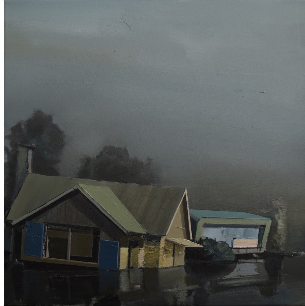
Ulf Puder Riva am Gardasee, 2020 Oil on canvas 40 x 40 cm