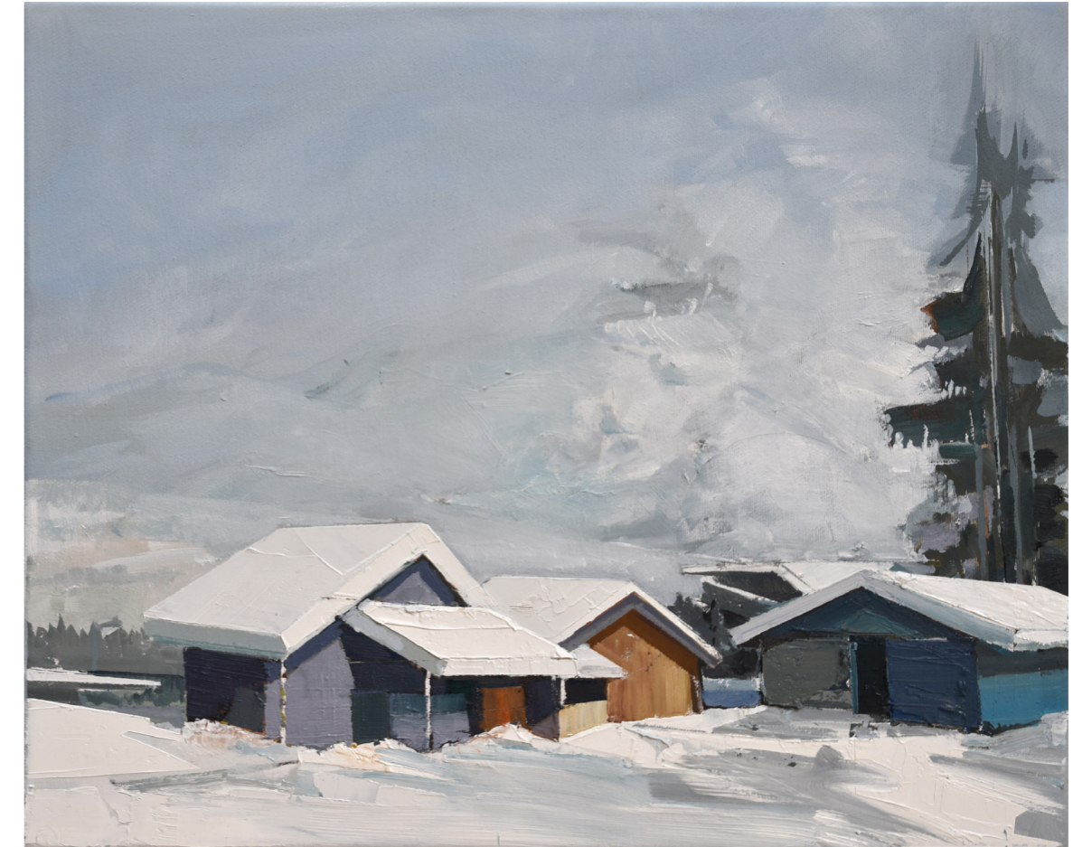
Ulf Puder Wintermorgen in St.Moritz, 2020 Oil on canvas 40 x 50 cm