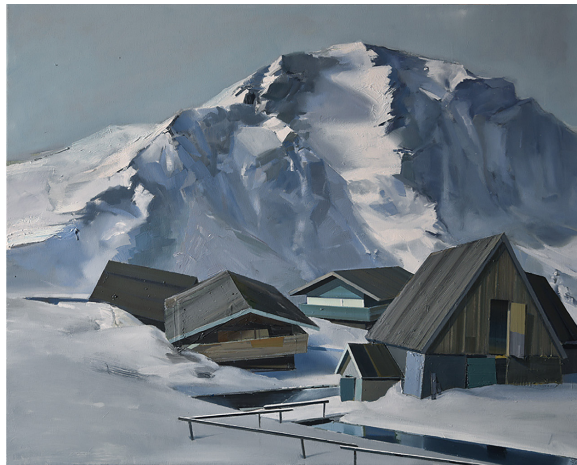
Ulf Puder Bauerngehöft, im Hintergrund der Saarstein bei Aussee, 2020 Oil on canvas 80 x 100 cm