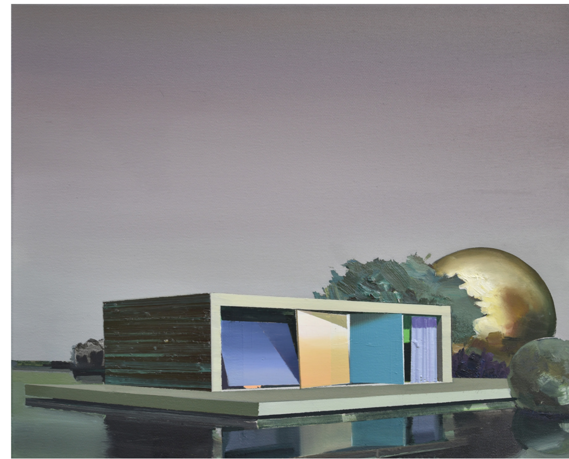
Ulf Puder Heroische Landschaft, 2020 Oil on canvas 50 x 60 cm