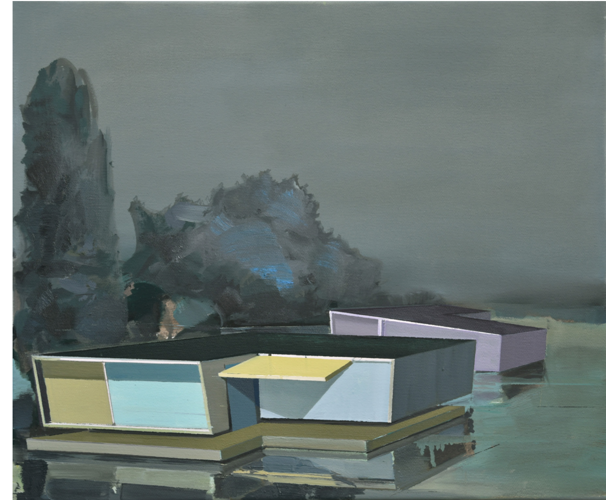
Ulf Puder Septembernebel in Seine-et-Marne, 2020 Oil on canvas 50 x 60 cm