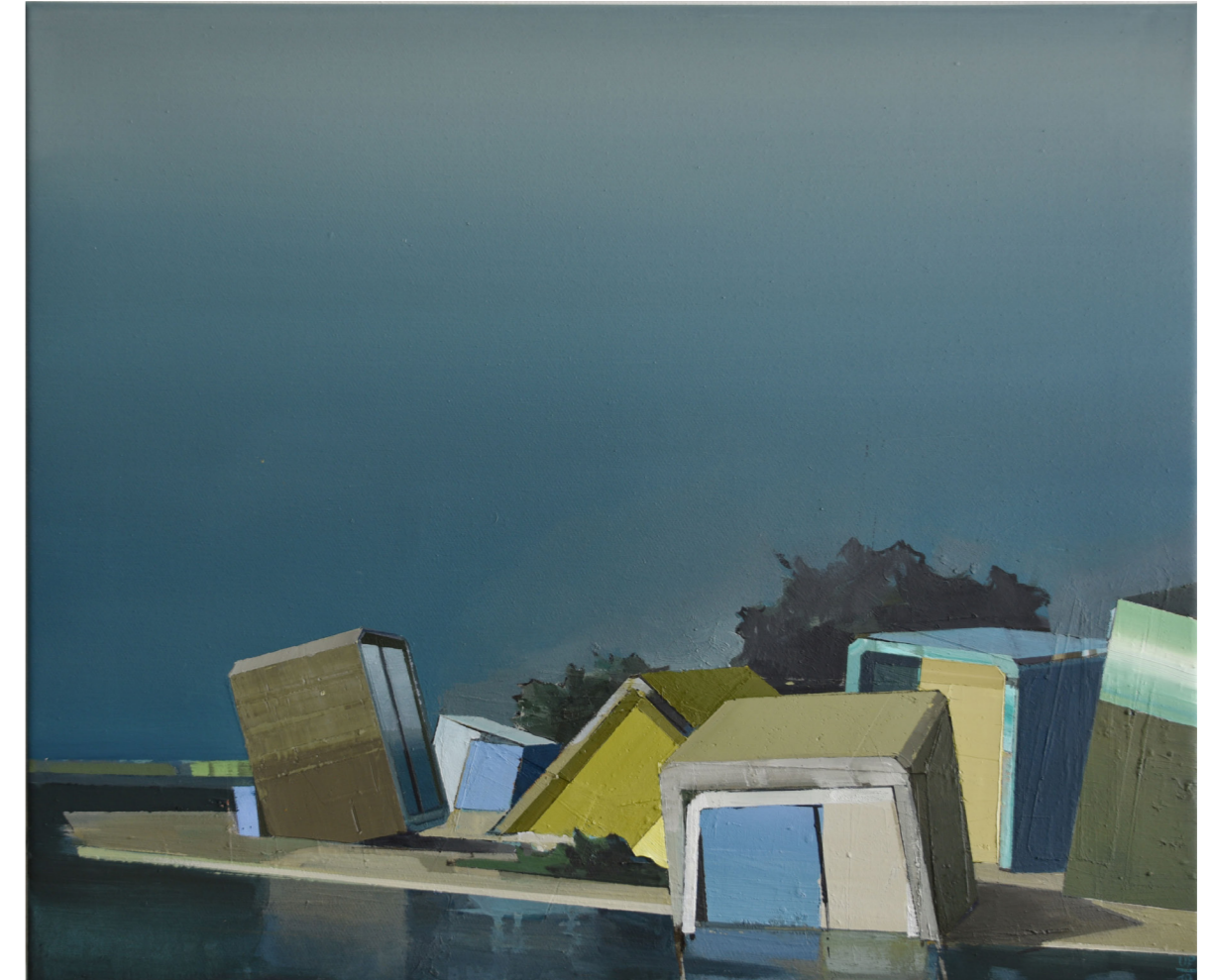
Ulf Puder Küstenlandschaft, 2019 Oil on canvas 50 x 60 cm