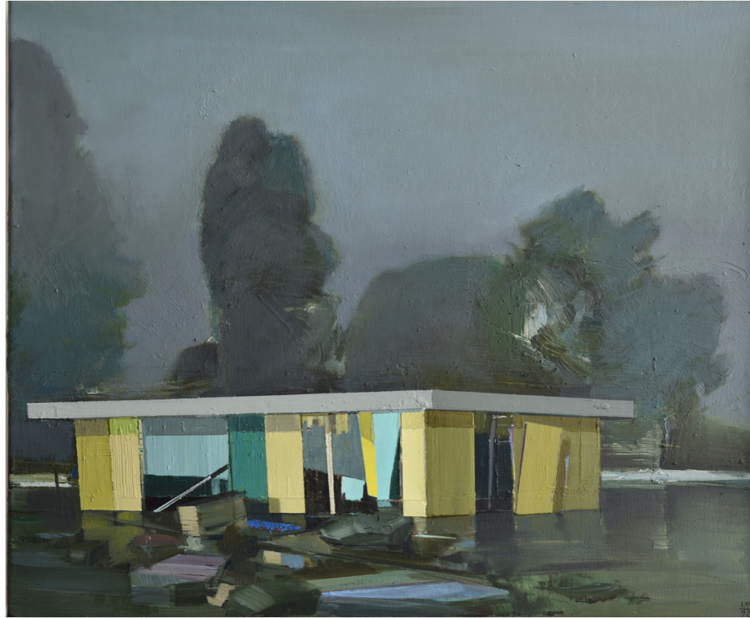
Ulf Puder Holländische Landschaft, 2020 Oil on canvas 50 x 60 cm