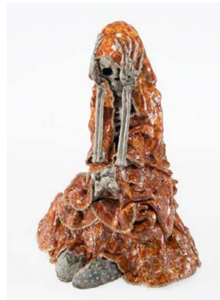
Carolein Smit Vanitas, 2012/2013 Ceramic 60 x 38 x 42 cm