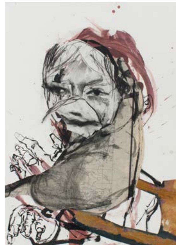
José Vivenes Se Vuelve Sin Sentido, 2019 Mixed media on paper 70 x 50 cm