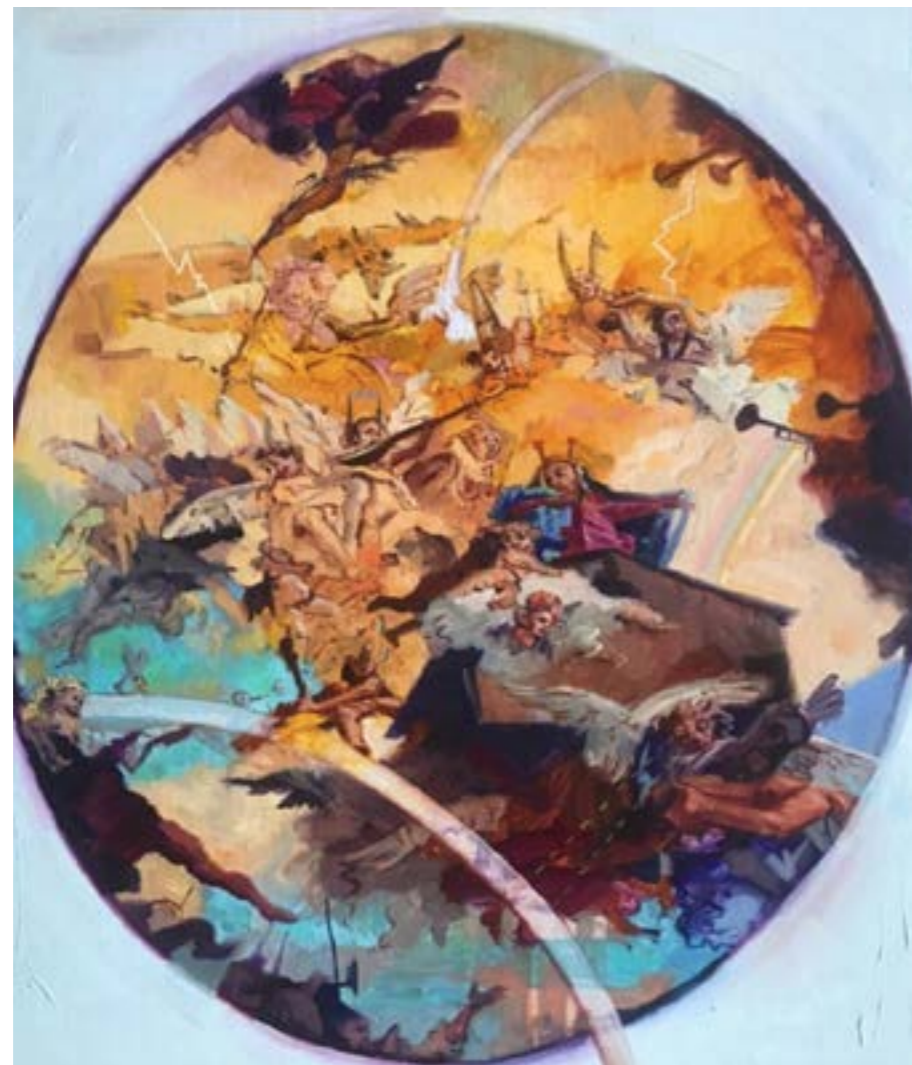
Jonny Green Band Practice, 2020 Oil on linen on cardboard 50 x 56 cm