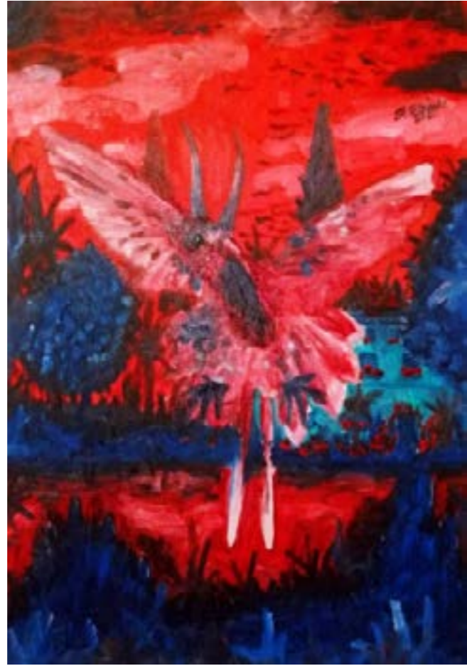
Florian Heinke God is family, 2020 Oil on canvas 70 x 50 cm