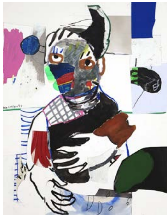
Starsky Brines Caleidoscopio Mixed media on paper 73 x 58 cm