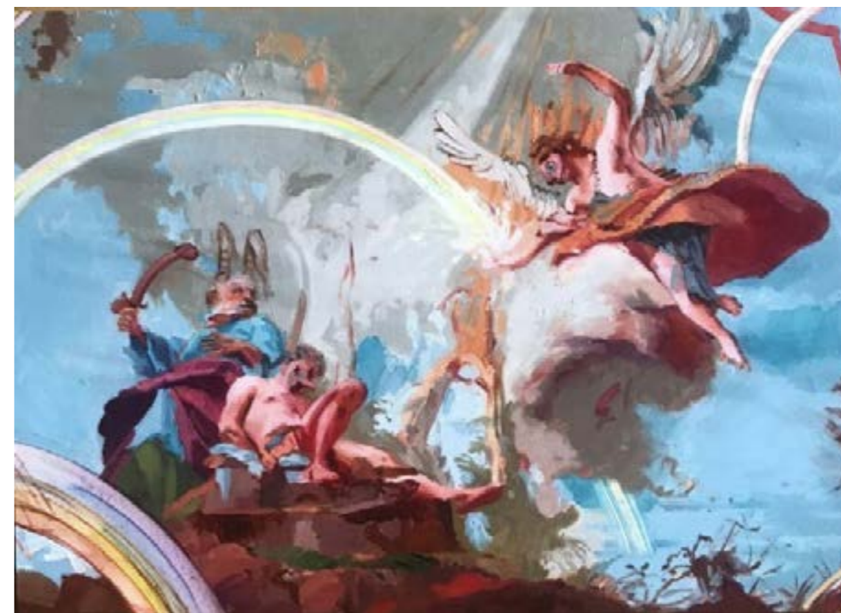
Jonny Green The Drunk Tank, 2020 Oil on paper on cardboard 53 x 38 cm