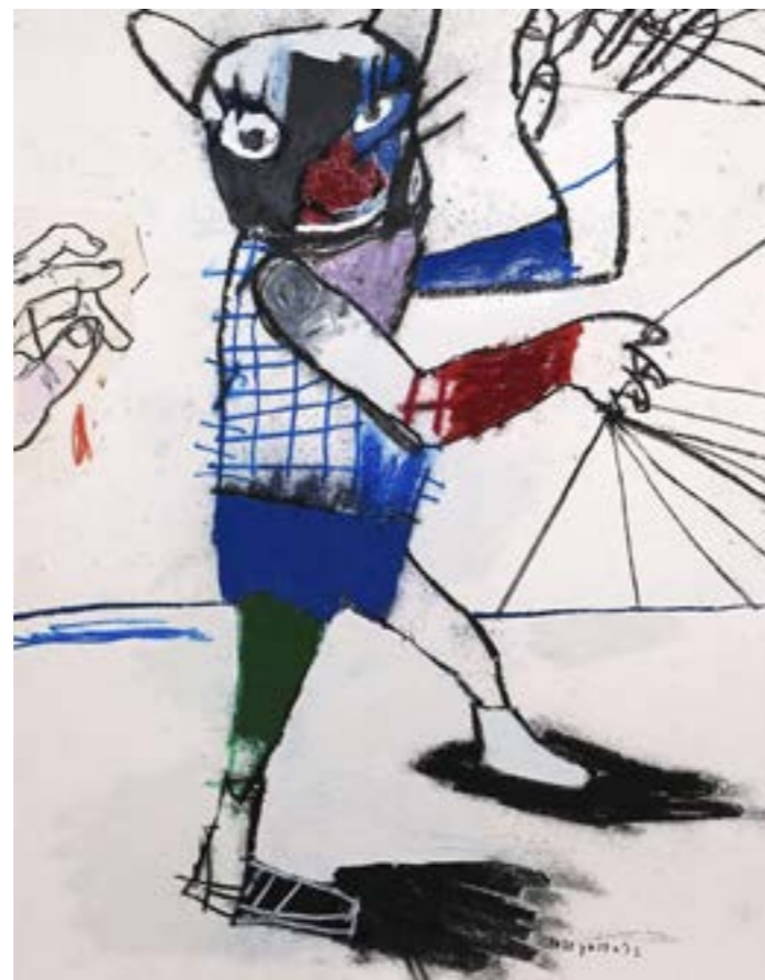
Starsky Brines Dejate querer Mixed media on paper 76 x 56 cm