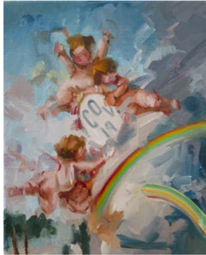
Jonny Green Coronation of the Covid King, 2020 Oil on canvas 25 x 20 cm