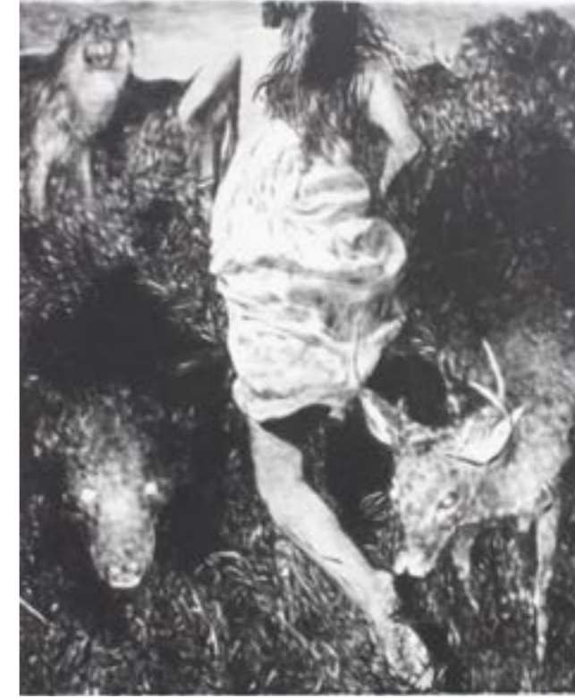
Florian Heinke Sonntag Nacht, 2019 Oil on canvas 50 x 60 cm