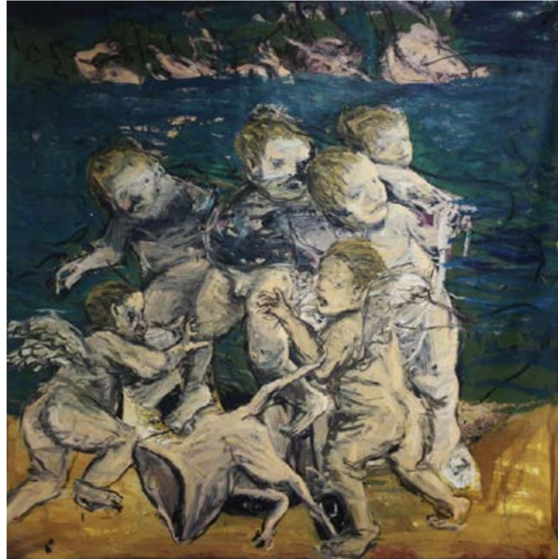
José Vivenes Lo verde devora los intersticios de formas a forma, penetra y penetra y abulta cada una, 2019 Oil on canvas 155 x 162 cm