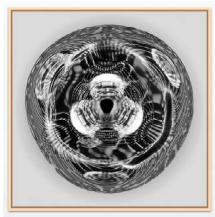
Björn Drenkwitz First Cry, 2020 Cymatik C-Print 100 x 100 cm