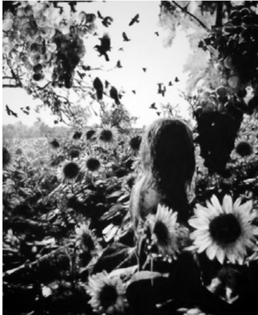
Florian Heinke Im Ende des Sommers, 2020 Oil on canvas 180 x 150 cm