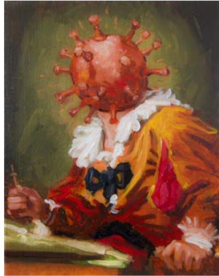
Jonny Green All Hail the Covid King, 2020 Oil on canvas 25 x 20 cm