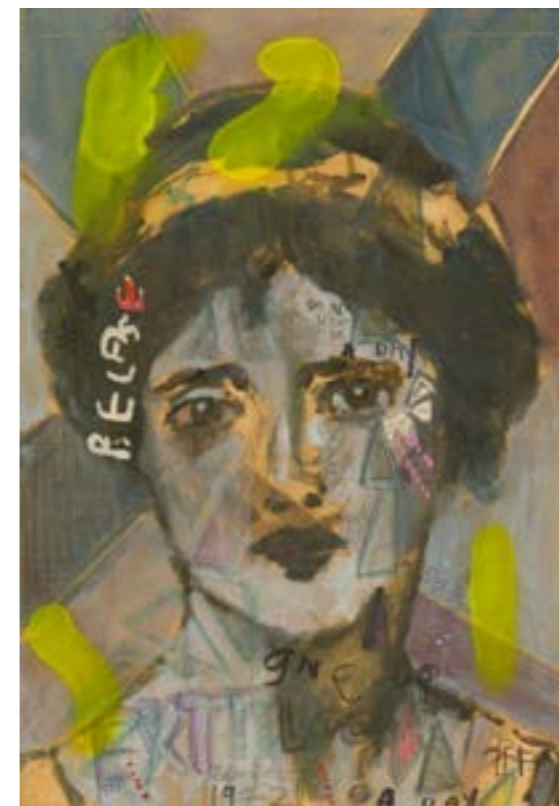
Sam Jackson It Is Not Because Of Anything I've Done, But Because Of Everything You Are, 2019 Oil, marker, pen and spraypaint on cardboard 32 x 22,5 cm