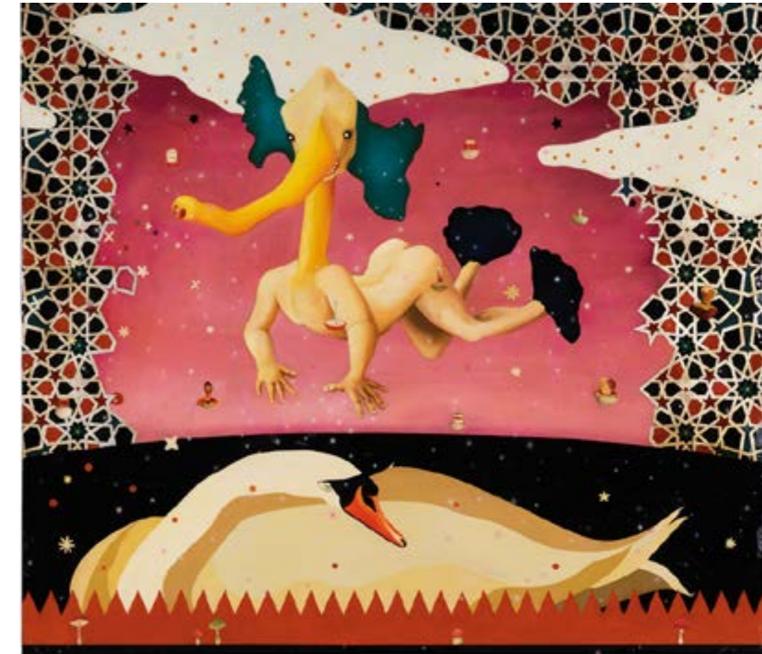
Dimitri Horta Songbird im Paradise, 2019 Mixed media on fabric on wood 180 x 240 cm