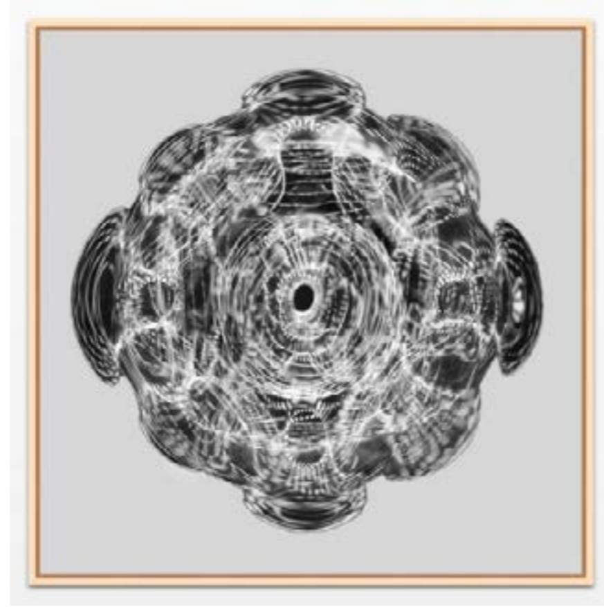
Björn Drenkwitz Last Breath, 2020 Cymatik C-Print 100 x 100 cm