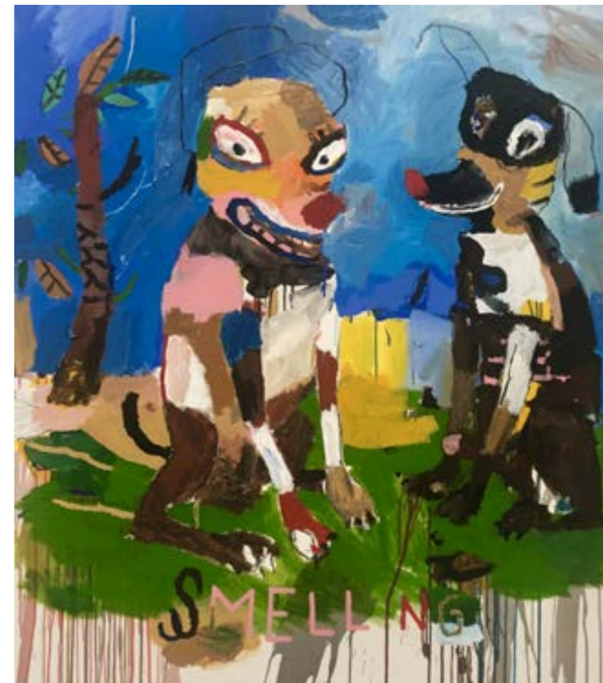
Starsky Brines Smelling, 2020 Mixed media on canvas 135 x 125 cm